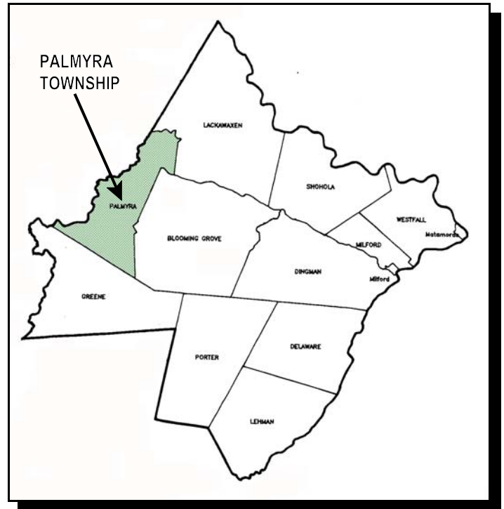
Palmyra Township in Pike County